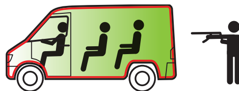
AUTOMOTIVE & TRANSPORTATION