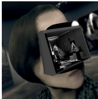
Lauren Moffatt Image Technology Echoes , 2020

Image credits (all cropped): © Courtesy the Artists