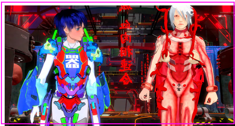
Lu Yang , The Great Adventure of Material World, 2019, video game. © 2019 Lu Yang

The exhibition RADICAL GAMING presents recent works created by artists who employ video game media to point out a new trend that diverges as much from pioneer 'Game art' as it does from conventional video games. What distinguishes artists who involve video game practices today? Undoubtedly, the works assembled here are characterised by their intentional and reflective use of the interactivity and immersion inherent to video games. Their artists invite viewers to take an active part in the work's actualisation, as opposed to other 'Game art' where the public experience the artists' audio-visual installations and performances. Interactivity is not only a playful component but is conceived as an element that contributes to conveying the artist's idea. These works certainly differ from traditional video games in their desire to provoke a speculative reflection rather than simply provide entertainment, as their themes often involve political and ecological issues and very often question stereotypes linked to social or gender affiliations. These content-related ambitions come close to those of indie video games, however, the exhibition's art works are distinguished by a third feature: They are the result of the assimilation of recent artistic strategies, and above all influenced by the so-called post-digital aesthetics of the second decade of the 21st century. The artists from this new generation of 'Game art' not