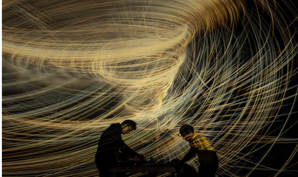
MOATIK & Maarten Vos, Erratic Weather , Photo: Tiberio Sorvillo

From September 17, 2021 , the public production phase will be followed by the presentation of the finished works in an exhibition, complemented by further artistic highlights such as the spectacular light installation Another Moon by Kimchi and Chips . Every day at nightfall, the installation will make