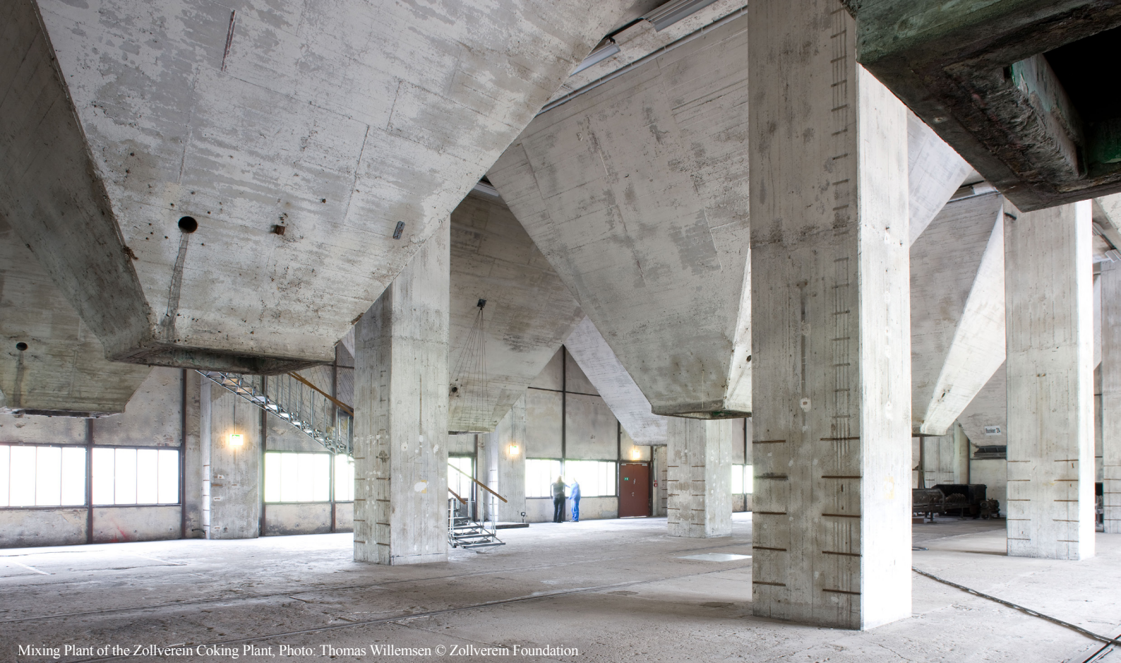
Mixing Plant of the Zollverein Coking Plant, Photo: Thomas Willemsen © Zollverein Foundation