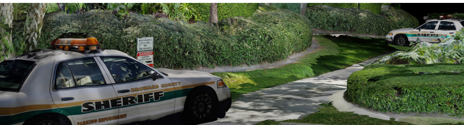
EMMANUEL VAN DER AUWERA: THE SKY IS ON FIRE , 2019

The video installation Wake Me Up at 4:20 is dedicated to internet trends, YouTube celebrities and the disturbing topic of suicide memes. In these memes, players are ultimately instructed to kill themselves. Inspired by true events, the stories of two young girls who committed suicide online and immediately became public celebrities, Van der Auwera has avatars created by 3D software philosophise about identity. Despite their archetypal appearance based on characters from video games, the avatars seem authentic due to their voices that stem from anonymous video comments from the net. The faces were partly animated with facial recognition software, a technology that also produces glitches, i.e. digital errors. These errors in the software cause the faces to freeze or become distorted, which makes them appear all the more vulnerable and appears to give these digital beings a trace of humanity.