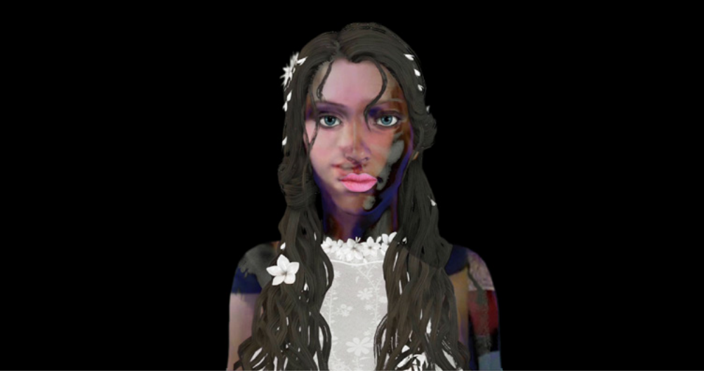
EMMANUEL VAN DER AUWERA: WAKE ME UP AT 4.20 , 2017 VIDEO, 12:22 MIN, STILL COURTESY EMMANUEL VAN DER AUWERA AND HARLAN LEVEY PROJECTS © EMMANUEL VAN DER AUWERA

The screen itself becomes material in Van der Auwera's video sculptures, and here, too, he is interested in revealing how the technical device works. A few years ago, Van der Auwera began manipulating LCD screens, cutting up their imaging polarising filters. Eventually, he removed them altogether, exposing their underlying mechanics. The screen, which is usually our window to world events, now offers only a blank view to the human eye. The images only become visible again through dark glass plates placed in the room on tripods or on the floor. Only the movement in the room and the right angle of view reveal the initially invisible flood of images to the viewers. The artist turns them into active participants.