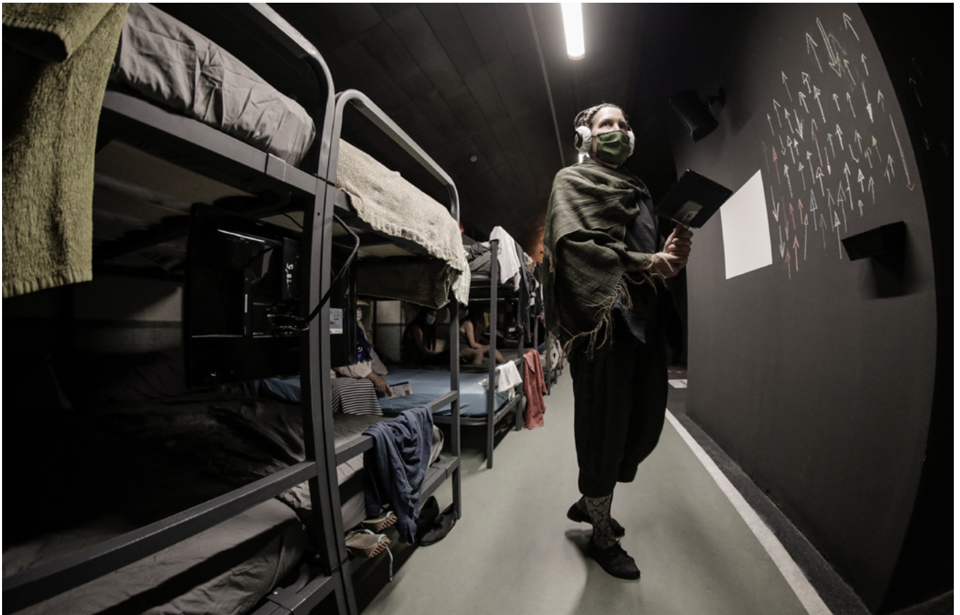
URBAN NATURE FROM RIMINI PROTOKOLL INSTALLATION SHOT