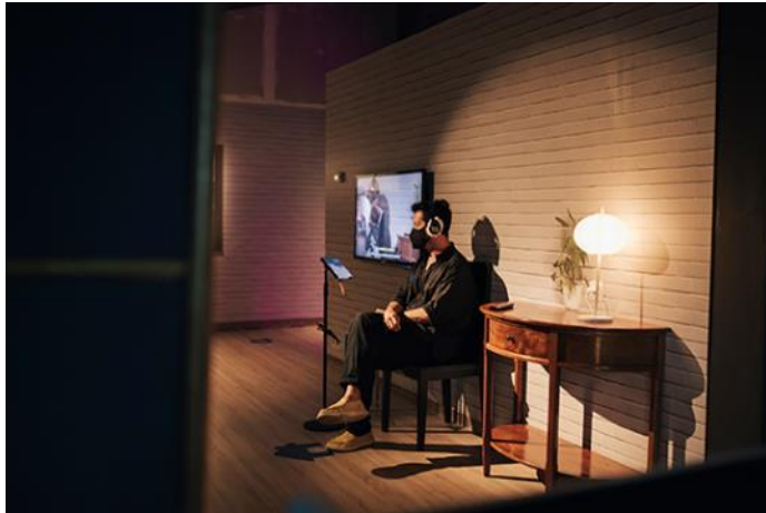
URBAN NATURE Rimini Protokoll Installation shot