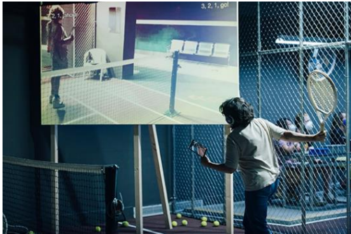
URBAN NATURE Rimini Protokoll Installation shot