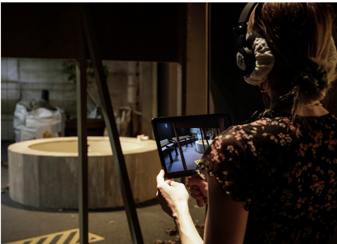
URBAN NATURE FROM RIMINI PROTOKOLL INSTALLATION SHOT