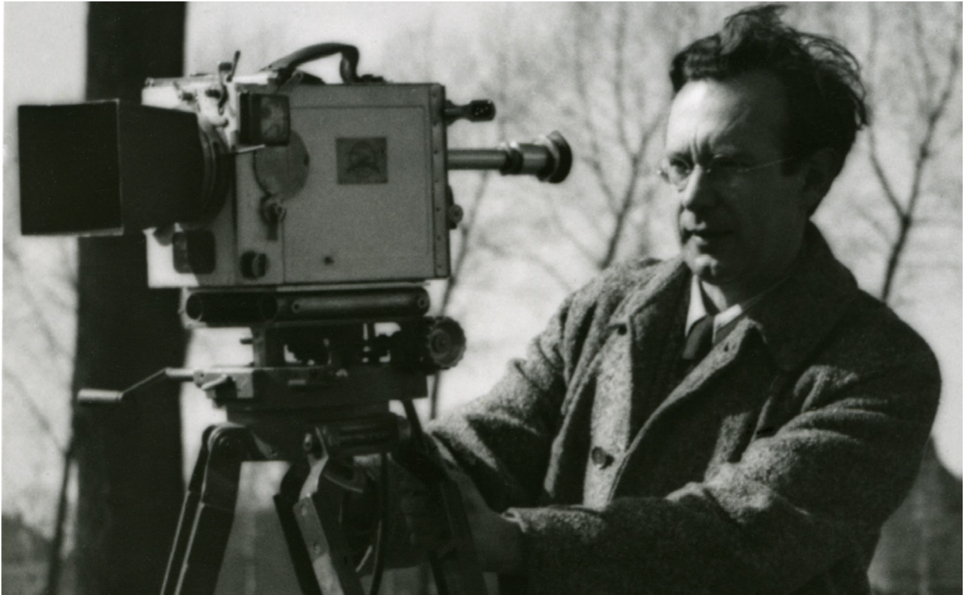
ALFRED EHRHARDT BEI DREHARBEITEN IN FLANDERN, AROUND 1940