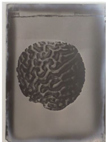
ALFRED EHRHARDT STRUKTUREN IM SANDBODEN, WATT, 1933-36/1967 SILBERGELATINEABZUG, 30,0 x 24,2 CM

An entire section of the exhibition is dedicated exclusively to examining the photo negative itself, which also brings astonishing things to light. Beginning with a glass negative, we guide visitors on a search for photography's hidden mysteries and the beauty of these mostly unseen artifacts. Examining a negative up-close under a lamp, loupe, and microscope, reveals many more things to us than a positive print, which is often only an image detail, allowing us to draw important conclusions with regard to research and dating.