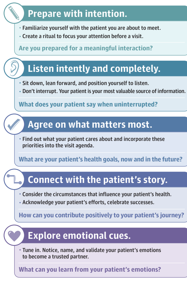
Figure 2. Recommended Clinician Practices to Foster Connection With Patients

upcoming encounter. While this is not traditionally part of the medical curriculum, some physicians reported finding value in making an explicit effort to pause. Specific practices anchored to routine tasks, such as handwashing (which in some religious rituals is a moment of centering), 19 might remind physicians that they are entering hallowed space, allowing them to be intentional; some might instead take 3 deep breaths before walking into the examination room. 20-22 These practices have been studied most frequently in the context of mindfulness-based stress reduction and physician wellness. A recent systematic review of 81 articles found that mindfulness interventions were associated with improvements in clinicians' anxiety, depression, and stress. 23 Brief breathing and mindfulness exercises have also been incorporated into more complex interventions that improve physician well-being and experiences with difficult visits. 20,22 Although a mindfulness-oriented practice might not appeal to all clinicians, experts generally agreed that it requires minimal training, is easy to implement in varied and busy clinical settings, and can be tailored per personal preference.