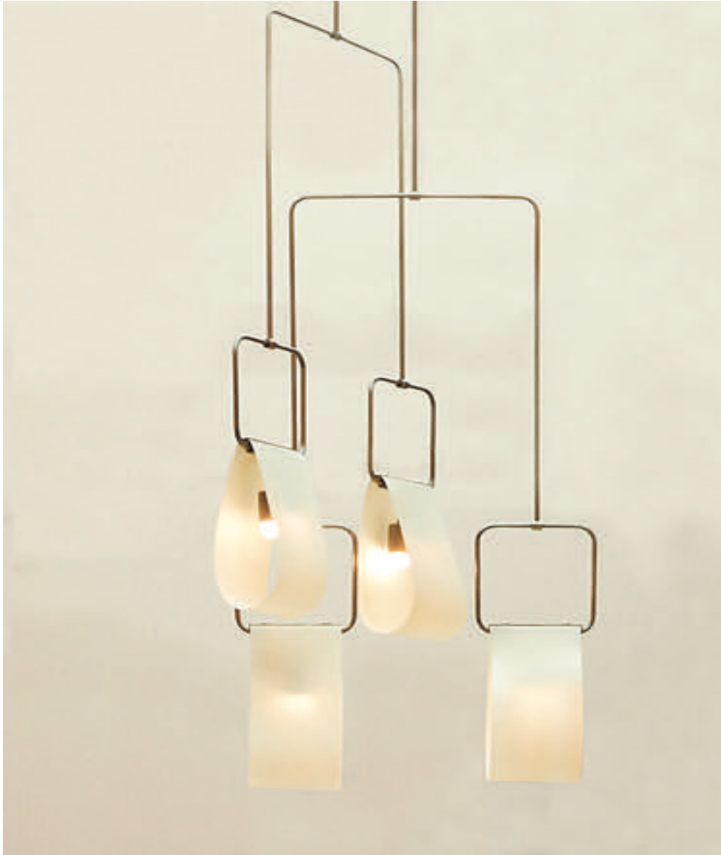
LOOP IV CHANDELIER