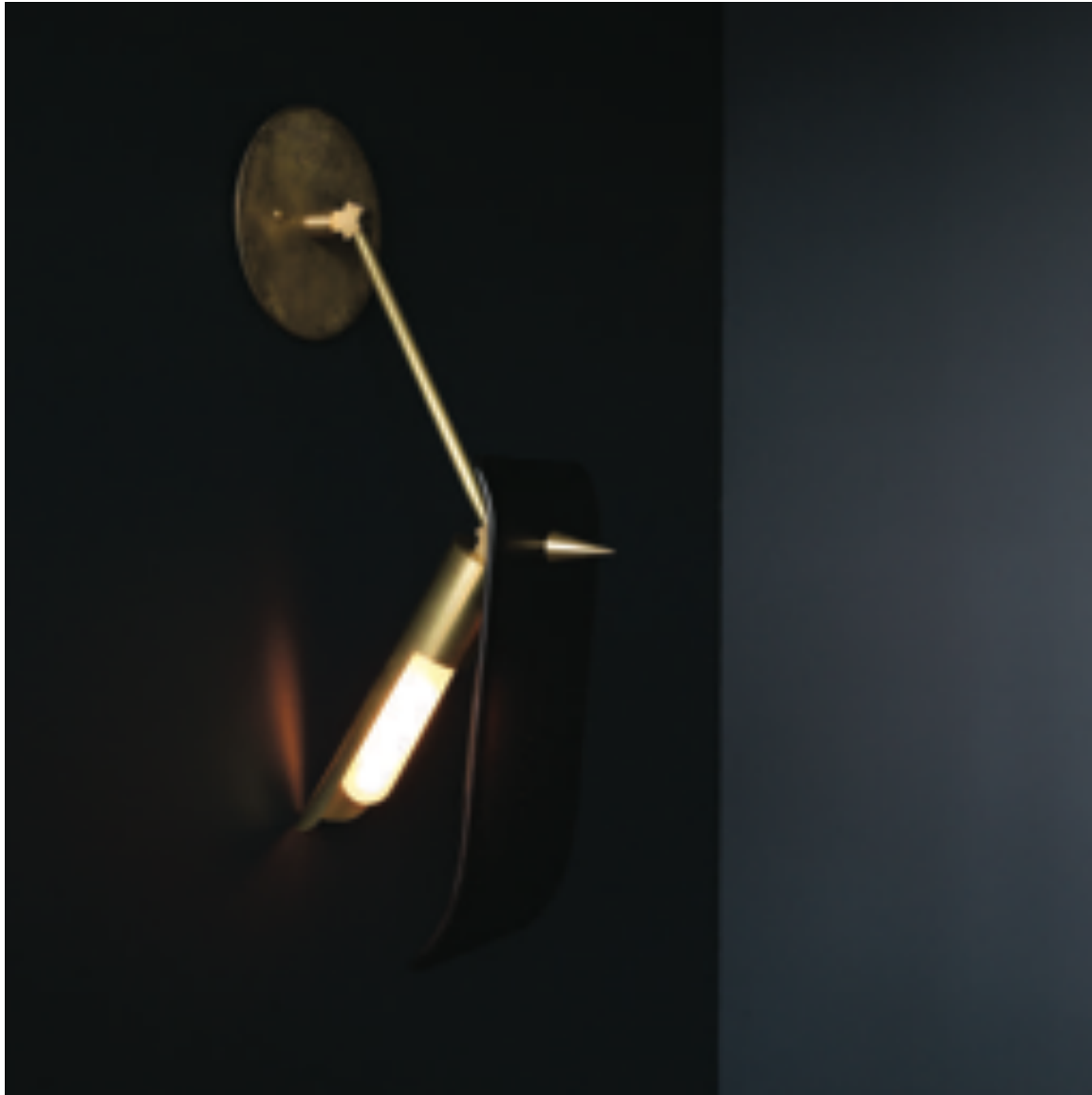
TSURU DROP SCONCE