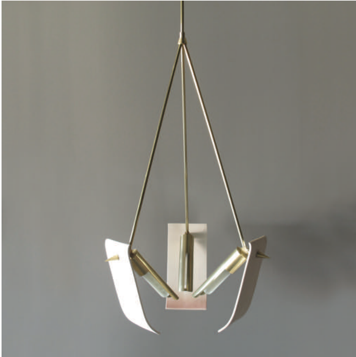
TSURU III CHANDELIER