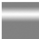
Mirror Polished Stainless Steel