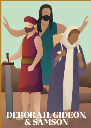
DEBORAH, GIDEON, & SAMSON