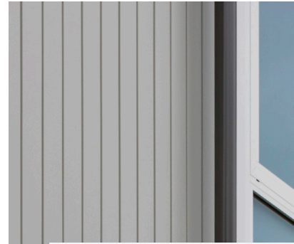
A-align Vertical Cladding

Another traditional weatherboard look, scalloped at the top with a more flush wall profile. Available in two profile depths. 187mm x 18mm (Ex. 200 x 25) and 142mm x 18mm (Ex. 150 x 25). Available in Concealed Fix and Nail Fix.