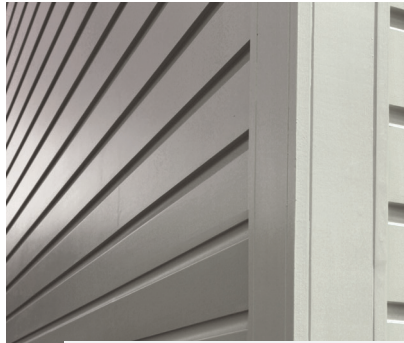
A-align Rusticated Cladding

The traditional weatherboard look, with each board overlapping the board below it. Available in two profile depths. 187mm x 18mm (Ex. 200 x 25) and 142mm x 18mm (Ex. 150 x 25). Available in Concealed Fix and Nail Fix.