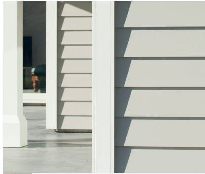
A-align Bevelback Cladding

Available in three profiles: Bevelback, Rusticated & Vertical.