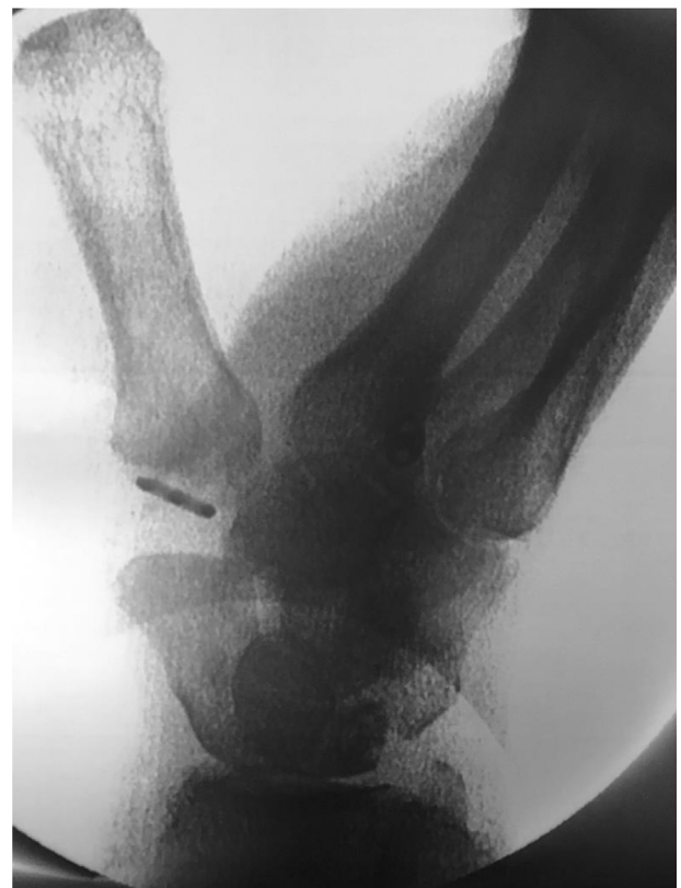
Figure 4. Intraoperative fluoroscopy can be used to ensure that 2 to 3 mm of space is present between metacarpal before tying the knot in the SBS.

Several limitations to our study are notable. Only 57% of patients completed postoperative DASH questionnaires, and because no baseline scores were collected or available, comparisons with more recent postoperative scores were impossible. Although all patients