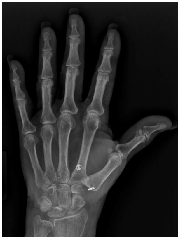
Figure 1. Placement of suture button suspension at the time of thumb CMC arthroplasty. Posteroanterior view of the thumb after SBS for CMC arthroplasty, showing a well-placed suture button at the corner of the thumb metacarpal and flare of the index metacarpal base. The scaphometacarpal space is well-preserved.

and tendon interposition (LRTI) using the flexor carpi radialis tendon. 1,3 In addition, other techniques have been developed using other donor sites, such as the abductor pollicis longus or only half of the flexor carpi radialis. 4,5 A promising alternative to LRTI is trapeziectomy with suture button suspensionplasty (SBS). As with LRTI, excising the trapezium removes half of the arthritic joint, which alleviates arthritis-related pain. 1 Passing a suture bridge through the base of the thumb and index metacarpals suspends the thumb metacarpal, preventing proximal migration and abutment against the scaphoid without the need to procure a donor tendon for suspension and the morbidity associated with it (Fig. 1).