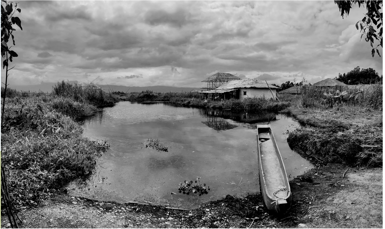
A dismantled homestay on the Loktak lake.