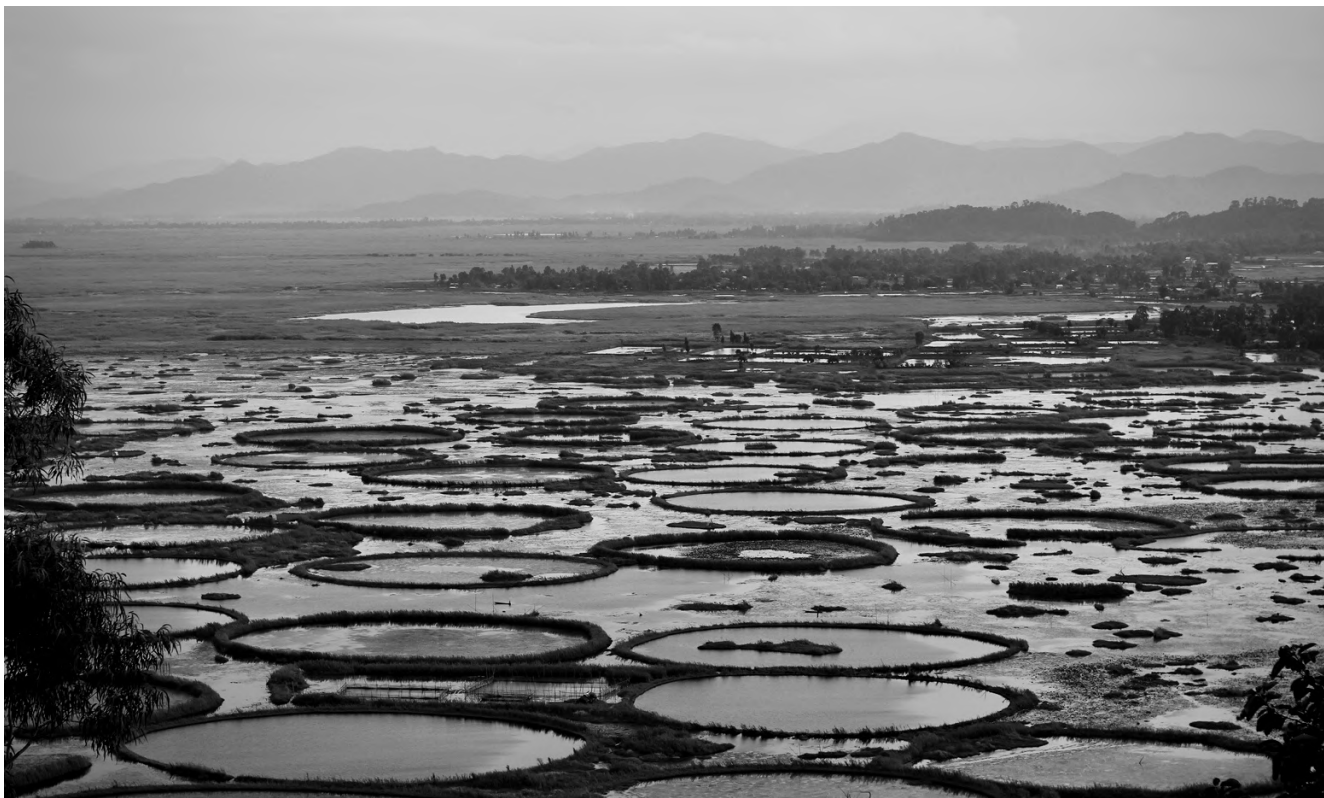
Ataphum rings on Loktak lake. Ataphum is a traditional method of capture-fishing.