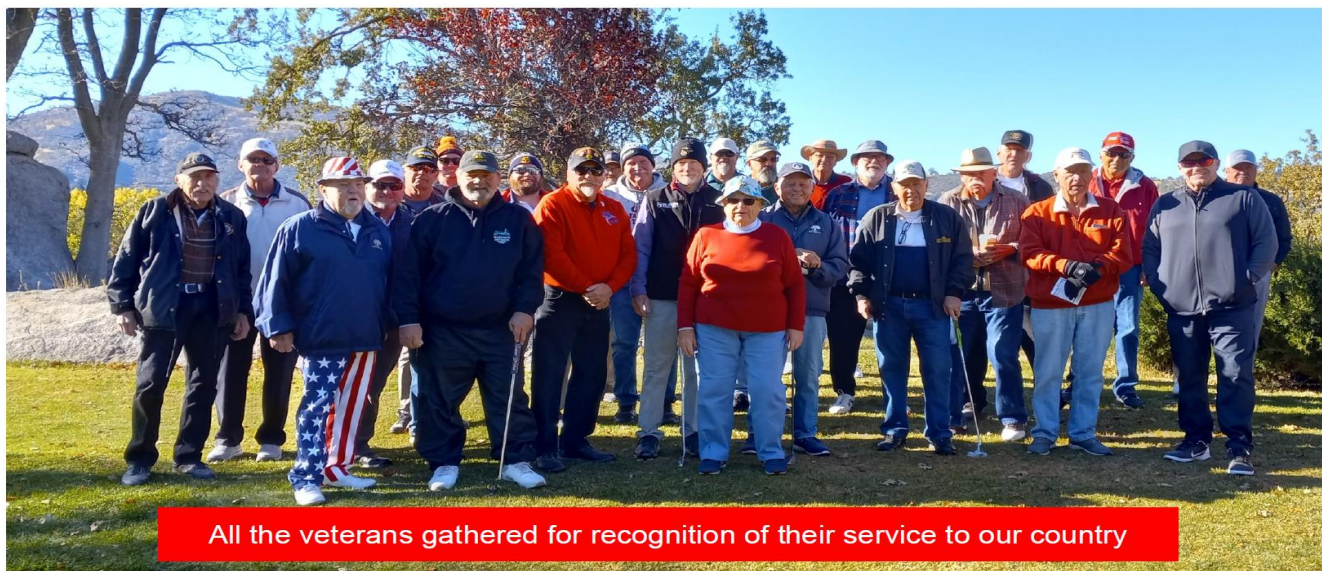
All the veterans gathered for recognition of their service to our country

On the course a drink cart filled with beverages was available for purchase. Also, on hole #4/13, young ladies were selling cookies and brownies, offering them free to the veterans. The lunch after play was provided by the Oak Tree Country Club and consisted of baked chicken, beans, coleslaw, and a cornbread muffin. While the day started out rather cool, it soon warmed enough for all the players to enjoy the day. And most importantly, raising money to support Honor Flight was paramount while thanking our veterans for all they had sacrificed for our freedom.