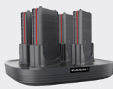
■ 94ACC0192 4-Slot Battery Charger