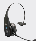
■ 94ACC0127 Bluetooth Headset VXI B350-XT