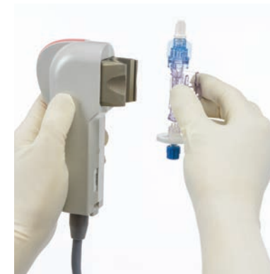
The shunt sensor is placed in the cable head.