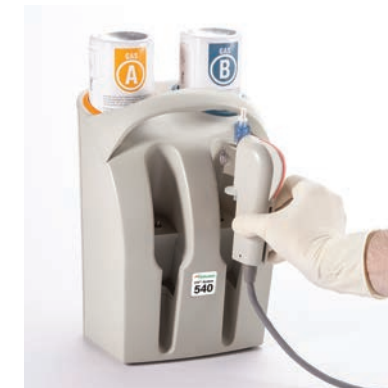
The cable head, with sensor attached, is placed in the calibrator.