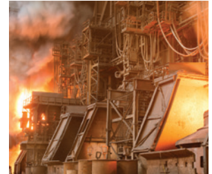
Flame & molten metal splash protection