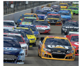
Protect wires from extreme engine temps