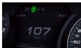
Intelligent Speed Control