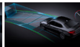
Traffic Jam/Highway Assist