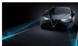
Lane Keeping Assist

The Alfa Romeo Giulia brings with IT advanced automated driving technology and is equipped for Level 2 autonomous driving with systems that intelligently monitor the car's surroundings without taking away the pleasure of driving