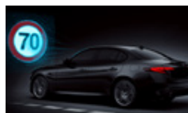
Traffic Signal Recognition