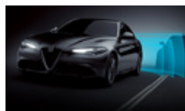
Active Blind Spot Assist