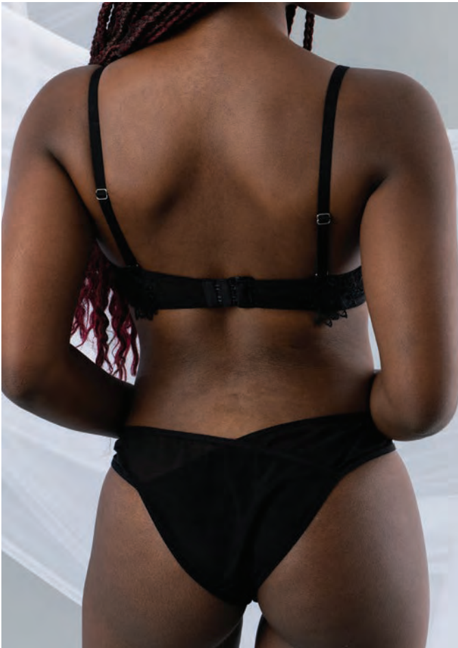
Mesh Underwired Multiway Bra 003-LL-00069