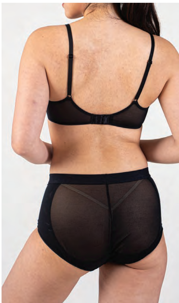
Plunge Unpadded Bra in Gingham Mesh 003-LL-00004