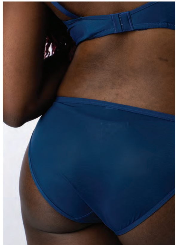
Non-pad V Wire Bralette Layering Low Rise Brief