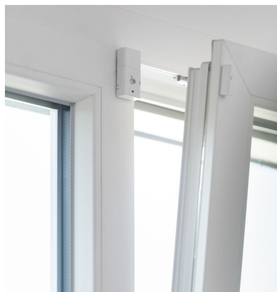
Simple to install and discreet on windows and doors

You can monitor important doors and windows easily and reliably and catch the moment it opens or closes. Also kitchen cupboards, baby gates or garden sheds can be kitted with this sensor. And most importantly, you get to decide if open or closed is good or bad.