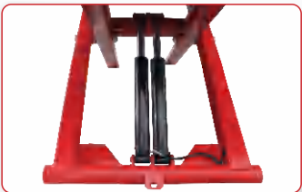
Two hydraulic cylinders and hydraulic safety locks.