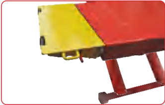
Adjustable approach ramps quickly extend the length of the platform.