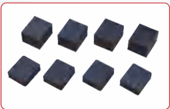
Both 1 1/2" and 3" height rubber pads are included as a standard issue.