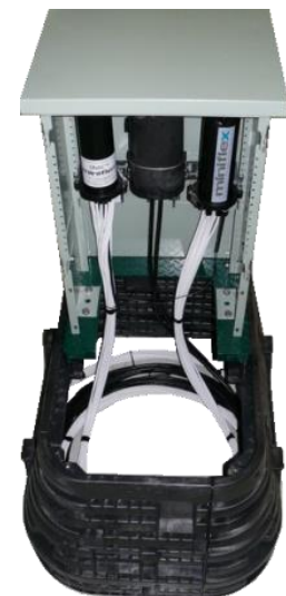
Vault mount option on Aluminum Lid