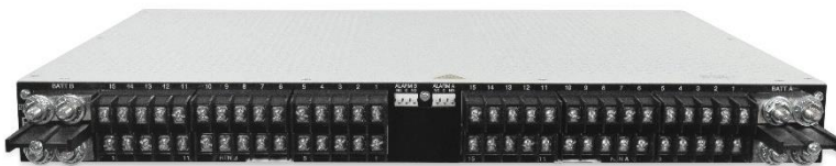
Fig. 2: 125GMT15 rear view

This platform provides front access to GMT fuses. Also featured are front LED indicators for power/fuse alarms, monitoring status, and rear connections for form C relay alarms.