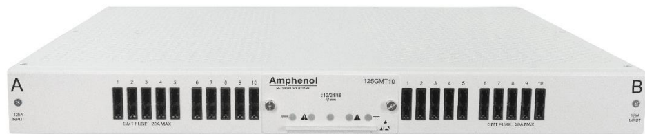
Fig. 1: 125GMT10 front view

Engineered into a standard 1RU footprint that support up to 20A GMT fuses in each position, providing ample capacity for distribution to a broad range of components. The panel is available in standard terminal block outputs or connectorized outputs.