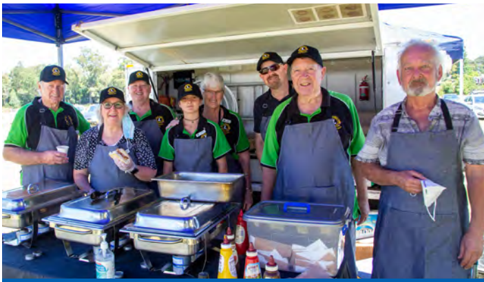
Twin Rivers Lions Club kept the crowds coming back for more with a sizzling barbecue.