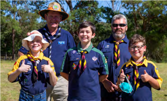
Bairnsdale Scout Group conducted the flag-raising while the national anthem was sung.