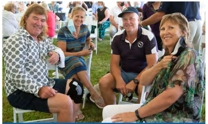
Guests waiting in anticipation to find out who the winners are.