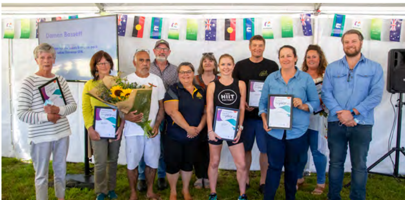
Community event organisers nominated for awards were praised for their efforts in a tough year to hold gatherings.