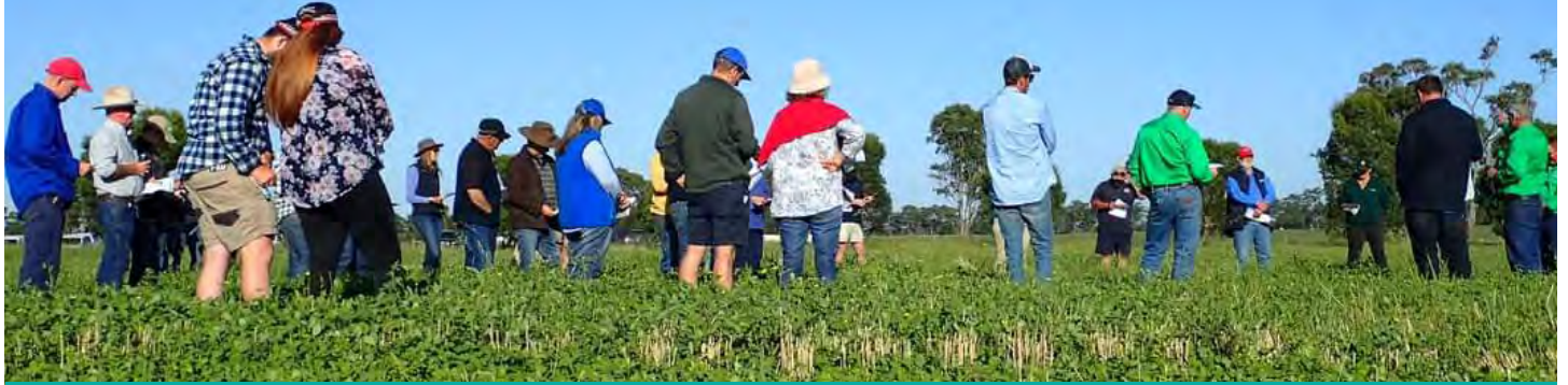
Trialing lucerne and arrowleaf clover at Forge Creek

Gippsland Agricultural Group Inc hosted a very successful Sowing the Gap Summer Field Day at the GAgG Research Farm in Bengworden, Bairnsdale, last month.