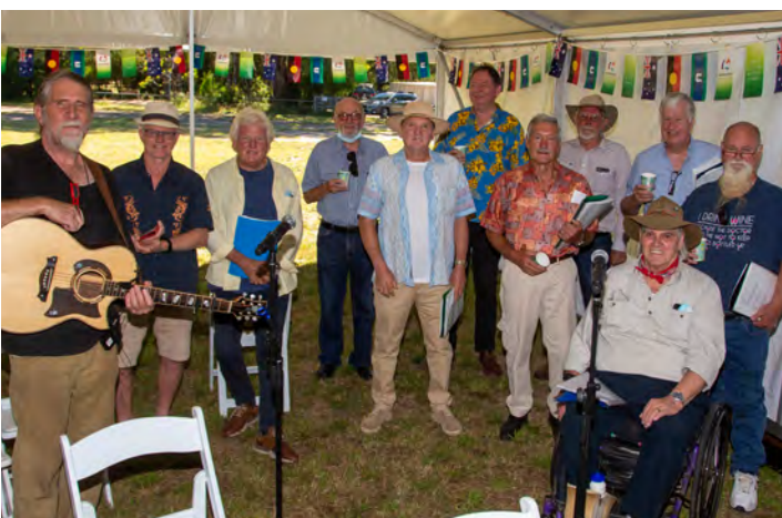
Crowds heard from the Nowa Nowa Men's Choir before the official proceedings.