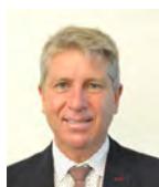
Cr Mark Reeves – Mayor