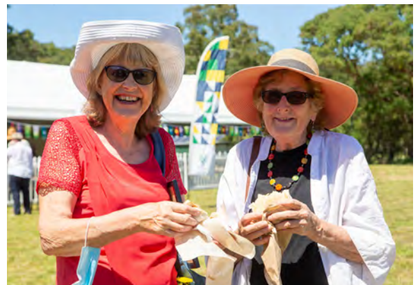
Crowds tucked into free egg and bacon rolls as well as coffee at the Nowa Nowa Recreation Reserve.