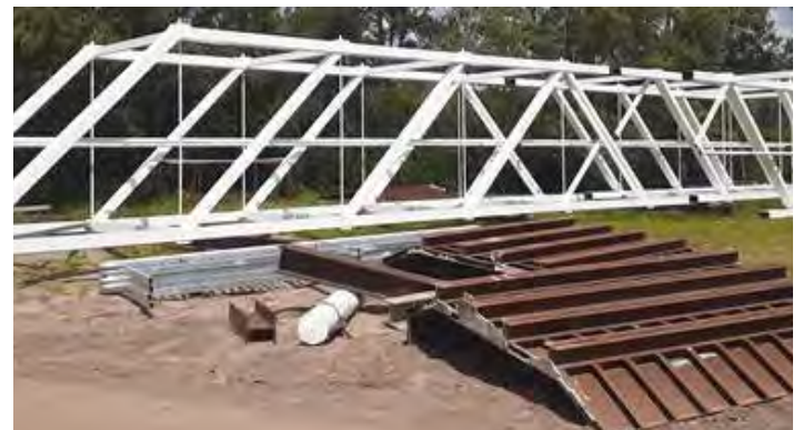
The Genoa River Pedestrian Bridge truss prior to installation.

The new bridge is completely funded by us and replaces the historic bridge that was unfortunately destroyed in the 2019-20 bushfires.