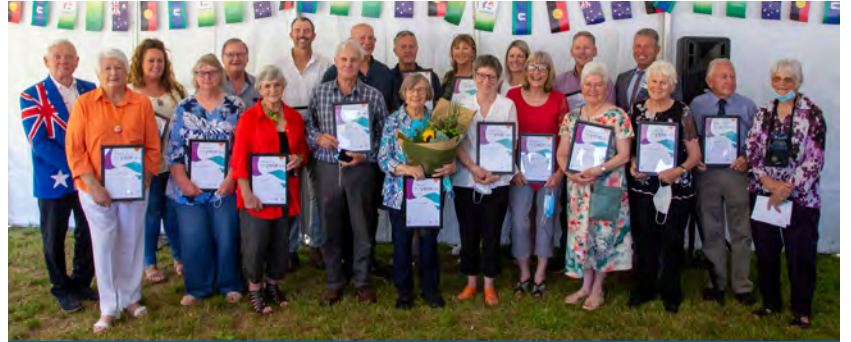
Over 20 individuals nominated for the Citizen of the Year Category who all contribute to our community more ways than one.