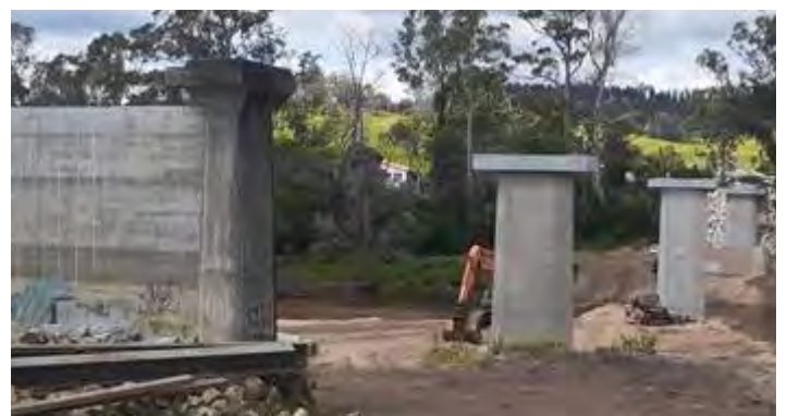
The completed substructure of the bridge.