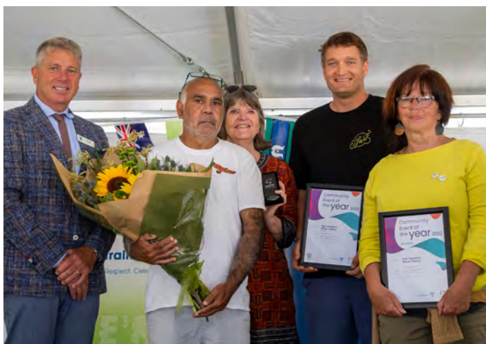
The East Gippsland Winter Festival was named East Gippsland's Community Event of the Year.