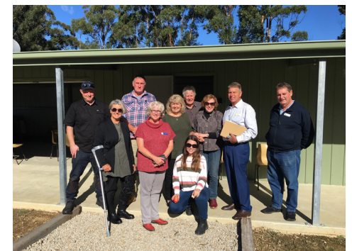
Councillors met with community members at Club Terrace on 16 May to discuss the construction of a new community facility following a successful Council funding application.