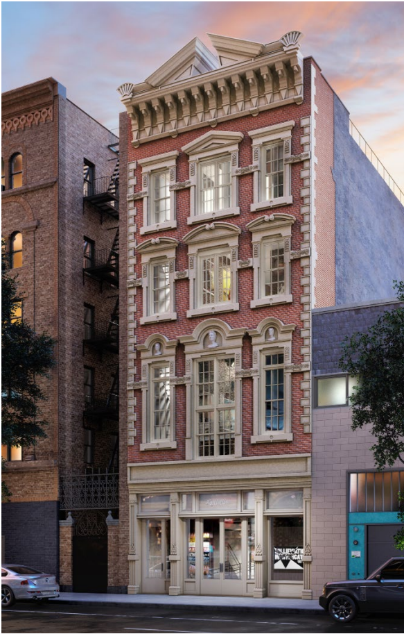
Rendering: 74 East 4th St.

La MaMa's historic, landmark building at 74 East 4th Street is undergoing an urgently needed complete renovation and restoration to preserve the historic façade, create building-wide ADA accessibility, and provide much needed performance, exhibition and community space for decades to come.