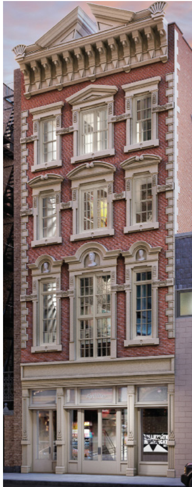
Rendering: 74 East 4th St.

La MaMa's historic, landmark building at 74 East 4th Street is undergoing an urgently needed complete renovation and restoration to preserve the historic façade, create building-wide ADA accessibility, and provide much needed performance, exhibition and community space for decades to come.