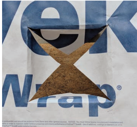
SLICE WRAP IN AN "X" IN A PROPERLY SIZED ROUGH OPENING