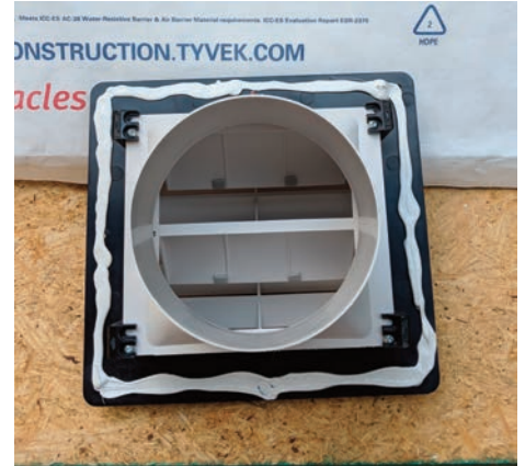
APPLY A LIBERAL AMOUNT OF CONSTRUCTION SEALANT. RECOMMENDED SIKA FLEX CONSTRUCTION SEALANT