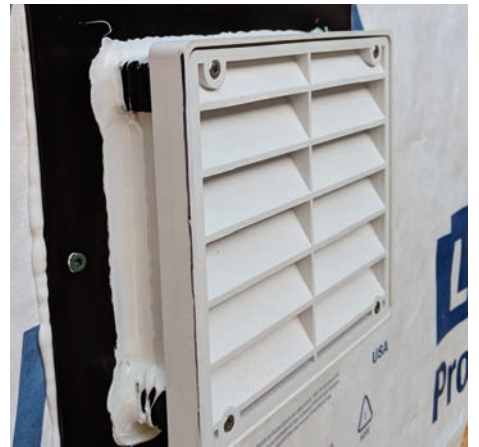
APPLY SEALANT AROUND BOX CAVITY AND MOUNTING FLANGE. LEFT SIDE