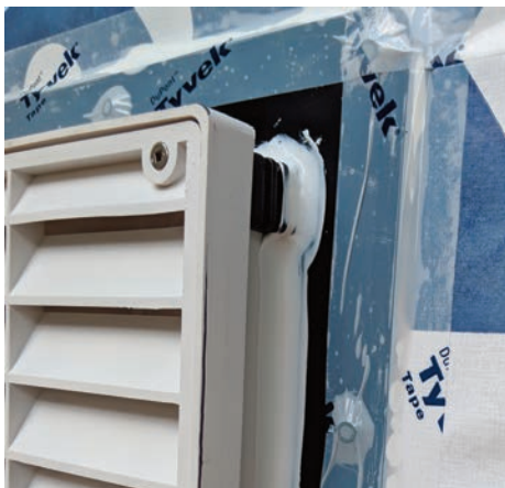
FINISHED, TOP RIGHT SIDE SHOWN. NO OPENINGS