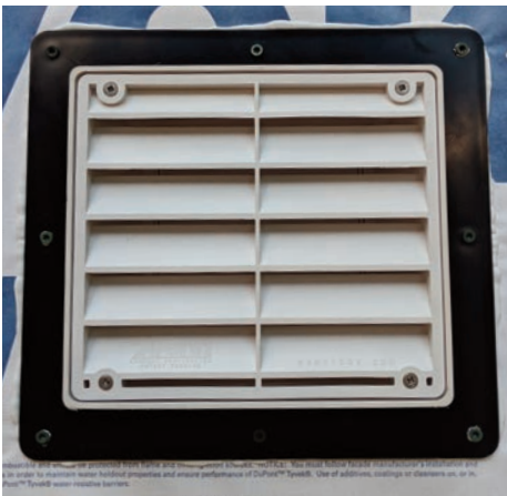
INSERT INTO OPENING AND FASTEN WITH SCREWS AROUND PERIMETER