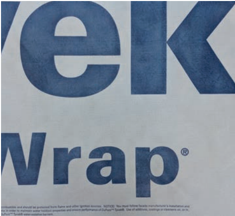
TYVEK BUILDING WRAP