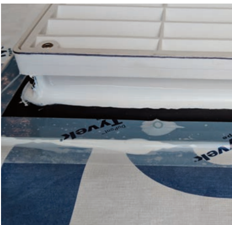
INSTALL TYVEK TAPE AROUND PERIMETER OF MOUNTING FLANGE, BOTTOM FIRST THEN SIDES FIRST THEN TOP.