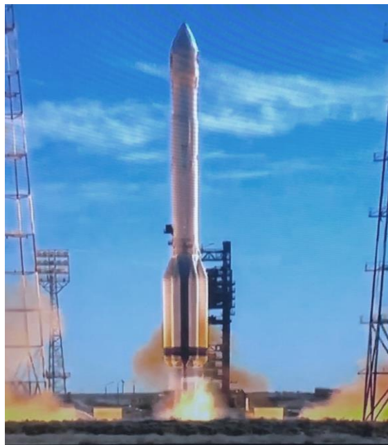
Proton-M Rocket with eROSITA lifting off from Baikonur

Over 25 years, Media Lario has been actively contributing to astronomical research. In the past year alone, Media Lario technology on the ALMA telescope array in Chile and on the LMT telescope in Mexico has been used to produce the first ever image of a Black Hole. The XMM-Newton X-ray space telescope, with Media Lario optical technology, has been used to find the 'missing' Baryonic Matter in the Universe. Now the eROSITA, built with Media Lario optical technology, will be used to scan the Universe in search of dark matter and dark energy, the last predicted components of the makeup of the Universe.