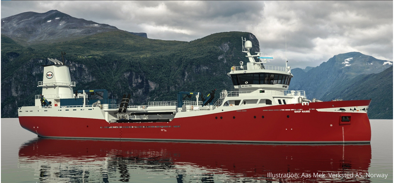
Illustration: Aas Mek. Verksted AS, Norway