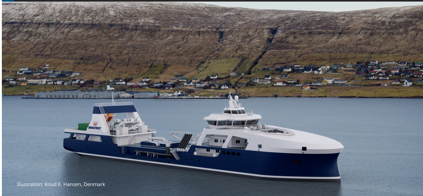
Illustration: Knud E. Hansen, Denmark