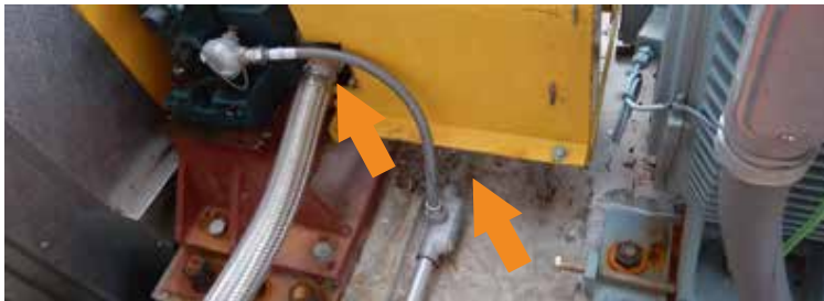
EXAMPLES OF OBSTRUCTIONS THAT WE WOULD NEED TO KNOW ABOUT