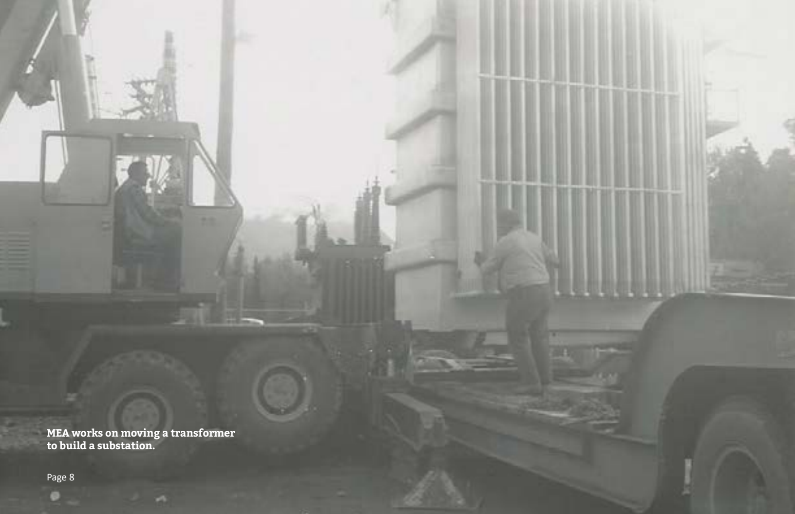
MEA works on moving a transformer to build a substation.