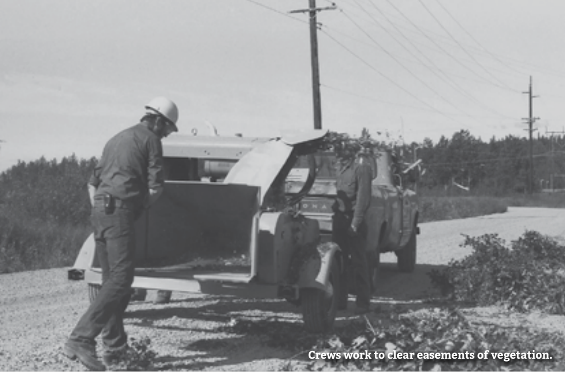
Crews work to clear easements of vegetation.