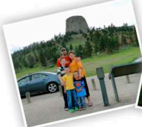
To Those I Love

to help with medical expenses and to set up scholarships for the three boys. Or you can make donations to the Sheridan Dog and Cat Shelter at 84 East Ridge Rd., Sheridan, WY 82801 or the St. Francis Animal Shelter at 109 Flatiron Dr., Buffalo, WY 82834.