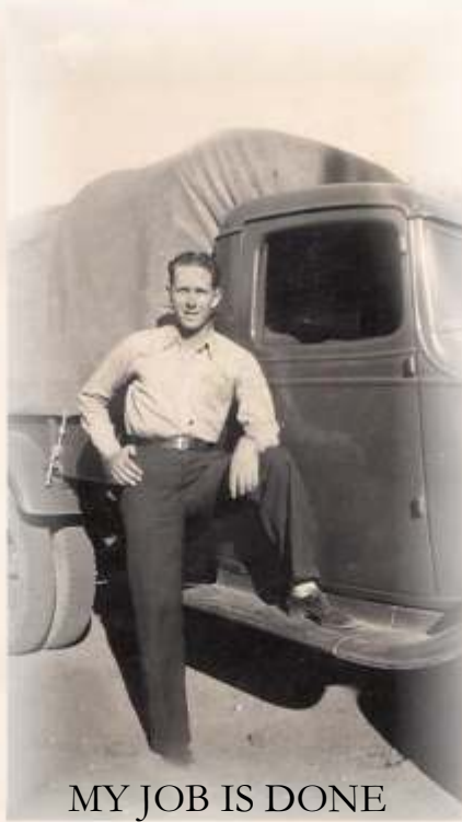
MY JOB IS DONE

When I am gone, release me, let me go. I have fulfilled my duty here; you all know. You must not tie yourself to me with tears, be thankful for our many beautiful years. I gave you my love; you can only guess how much you gave to me in happiness. I thank you for the love you each have shown, but now it's time I traveled all alone. So grieve a while for me, if grieve you must, then let your grief be comforted by trust. It's only for a time that we must part, so bless the memories within your heart. though you can't see or touch me, I'll be near, and if you listen with your heart, you'll hear. All my love around you from morn til night; I'll forever have you in my sight. And then, when you must come this way alone, I'll greet you with a smile and say: WELCOME HOME!