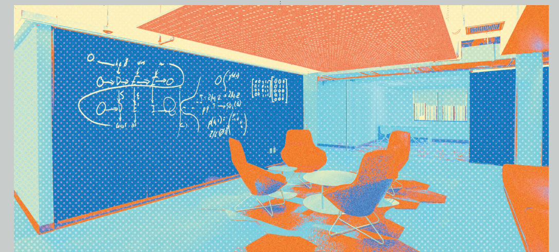
Ronald and Maxine Linde Hall of Mathematics and Physics

6 BUILDING AND RENOVATION PROJECTS New construction accelerates discovery with cutting-edge facilities and collegial spaces.