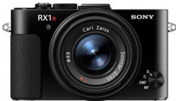
Sony RX1R II