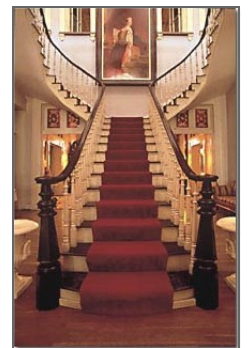
Grand Staircase at Belmont Mansion