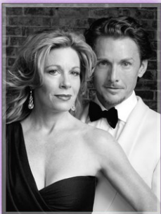
Marin Mazzie Jason Daniele