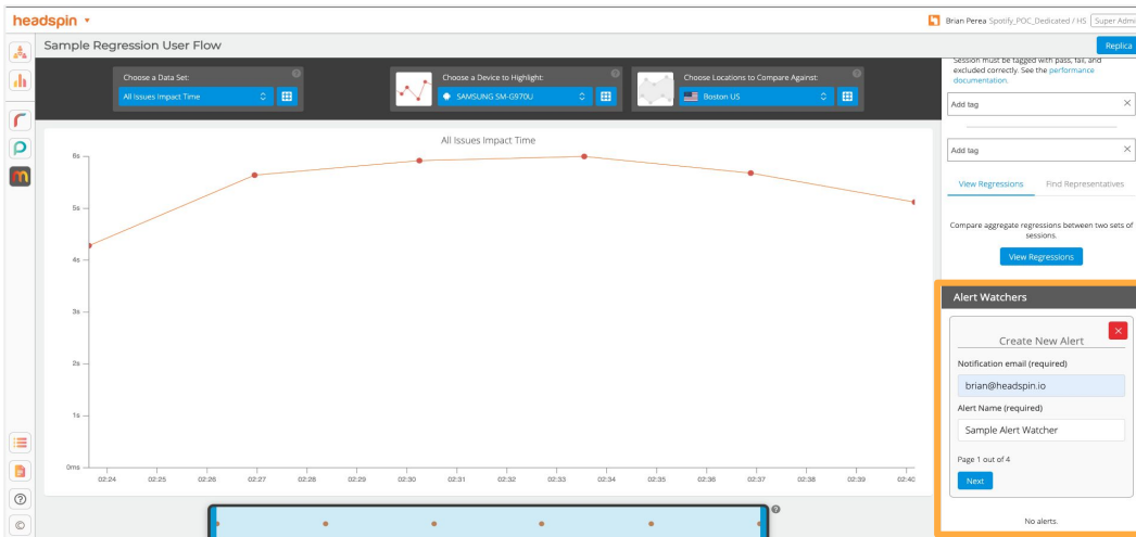
A user-friendly interface enables you to easily compare aggregate metrics across builds, locations, and devices.