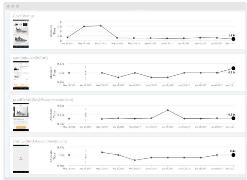
Automatically profile and baseline every build of your app and identify performance degradation as soon as issues are introduced.

Seamlessly integrate into continuous integration workflows and automatically analyze every build of your app. Speed up your release checklist and catch hard to find issues.