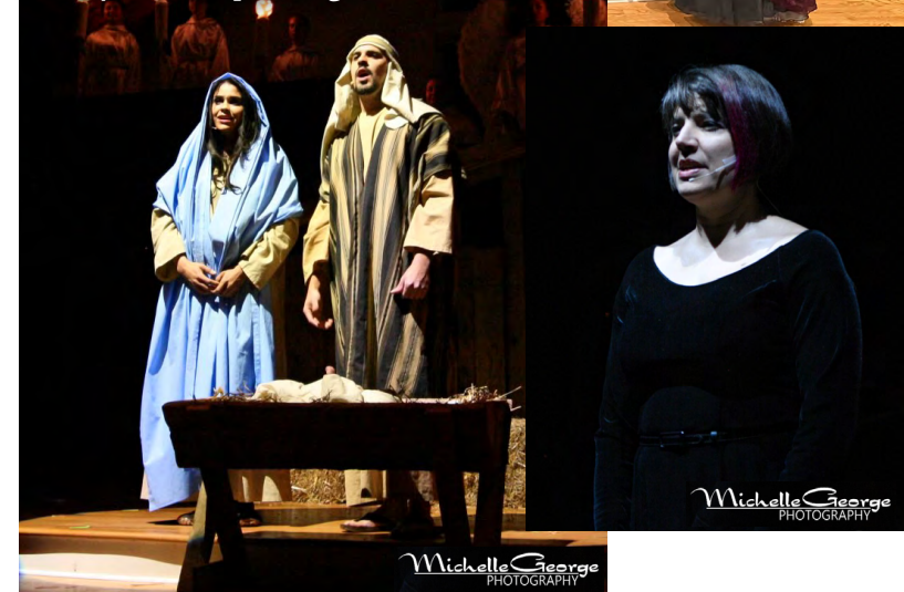
"Mary" & "Joseph" sing

like this church has done, is a fantastic way to build friendships with neighbors and coworkers where we live.