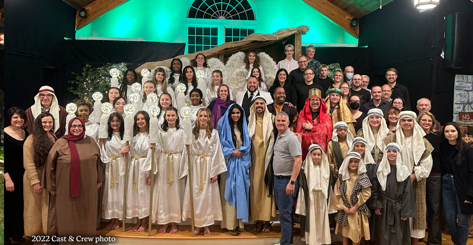
2022 Cast & Crew photo