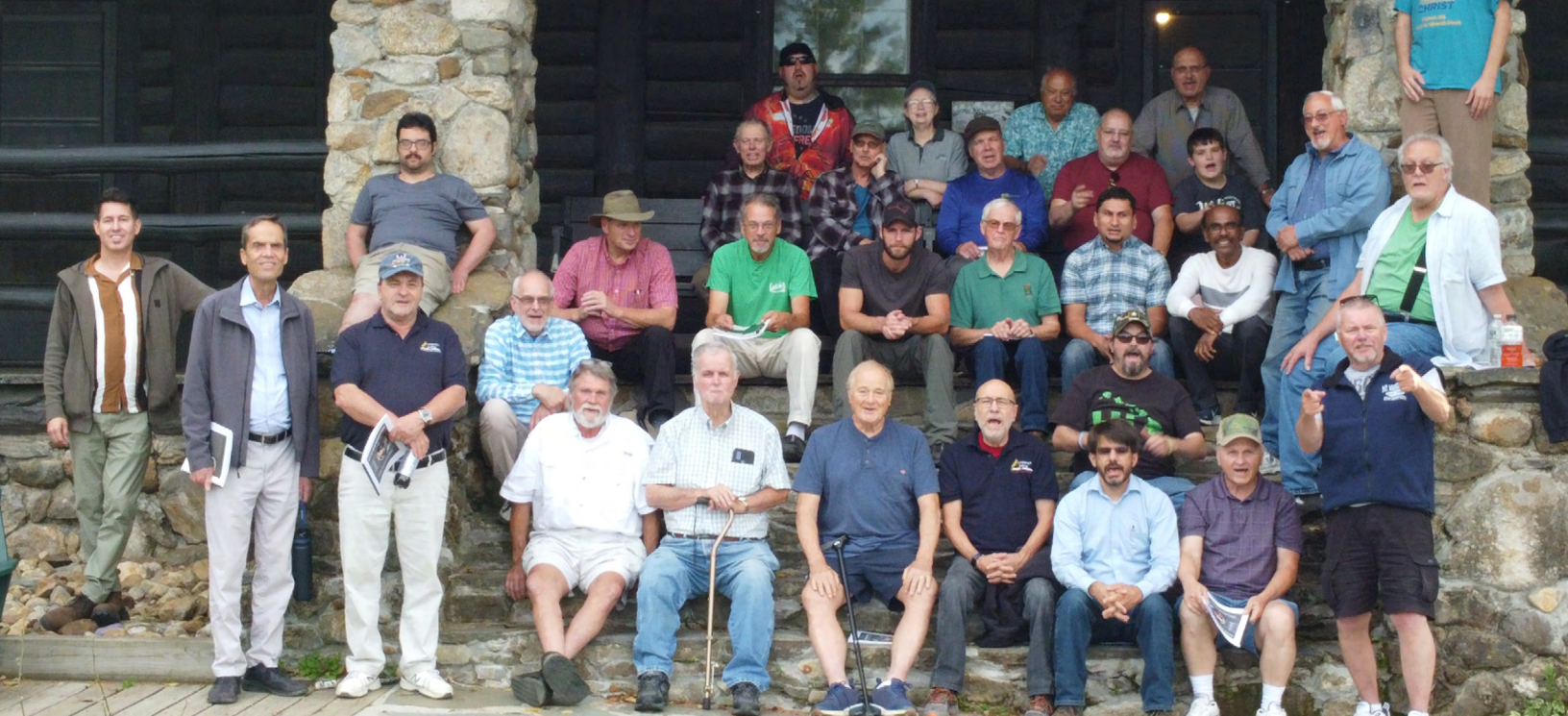
Group photo at the 2022 Fall Men's Retreat