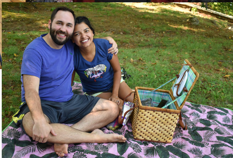
Above photos taken at the 2022 Marriage Retreat

There is always room to grow, even in the best marriages. A willingness to invest ourselves more fully in this priceless relationship comes with great rewards. If you have an open heart, these retreats are also a wonderful time for fellowship, good food, and fun! And yes, there are opportunities to share your