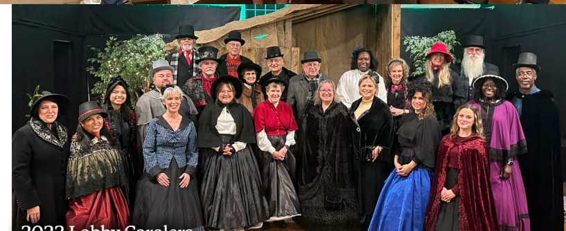
2022 Lobby Carolers

You will want to mark "the Greatest Gift" on your calendar for this December 2023. (Date TBD) Establishing a yearly presence in the community,