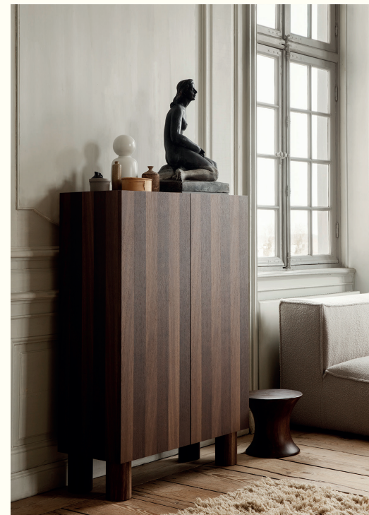
POST STORAGE CABINET

Here, ferm LIVING introduces a selection of the design brand’s SS22 collection: Post Storage Cabinet, Ark Dining Chair, Spin Stool, Agnes Plant Stand, Filo Table Lamp, Era Chandelier, Esca Piece, and the Oli Glassware collection.