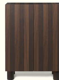
POST STORAGE CABINET

Material: FSC™-Mix certified oak veneer with MDF core. Handmade marquetry smoked oak veneer in tonal stripes. Veneered legs Size: H: 134 x W: 92 x D: 42.5 cm Price: EUR 2.239