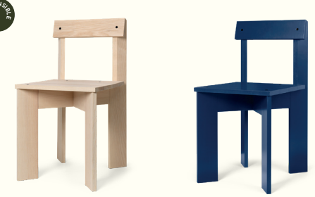
ARK DINING CHAIR

Material: FSC™-certified beech wood. Lacquered. FSC™-certified ash wood. Surface treated Size: H: 78 x W: 40 x D: 45.7 cm Price: EUR 269