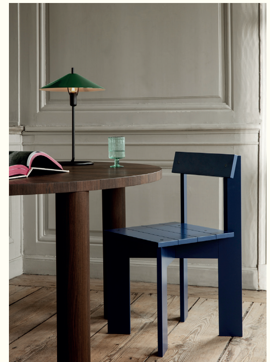
ARK DINING CHAIR

Material: FSC™-Mix certified oak veneer with MDF core. Handmade marquetry smoked oak veneer in tonal stripes. Veneered legs Size: H: 134 x W: 92 x D: 42.5 cm Price: EUR 2.239