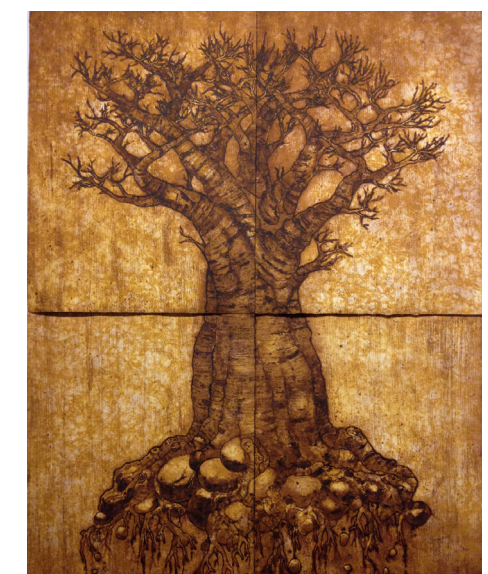
Elmari Steyn — Transpose , Collograph, 110cm x 150cm