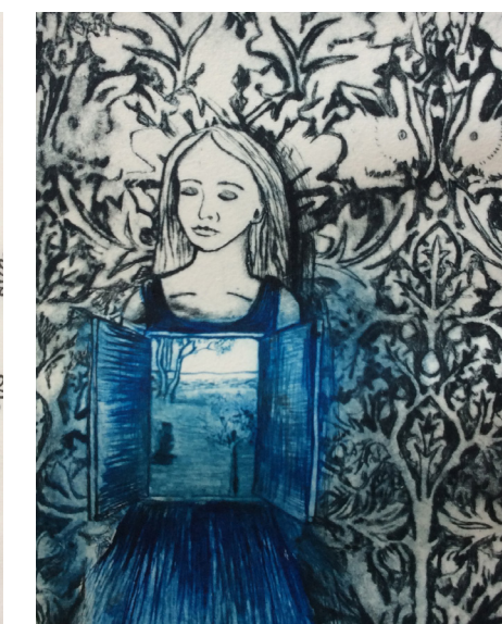
Shana James — Internal External , Intaglio Drypoint, 21cm x 30cm