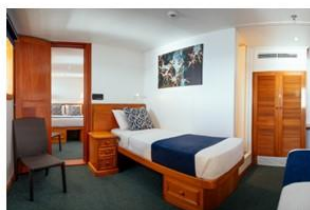
Connecting Family Ocean Stateroom