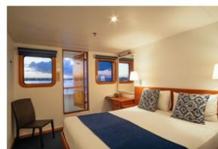
C & B Ocean Stateroom