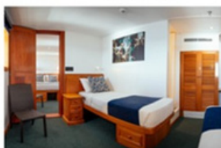
Connecting Family Ocean Stateroom