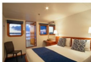
C & B Ocean Stateroom