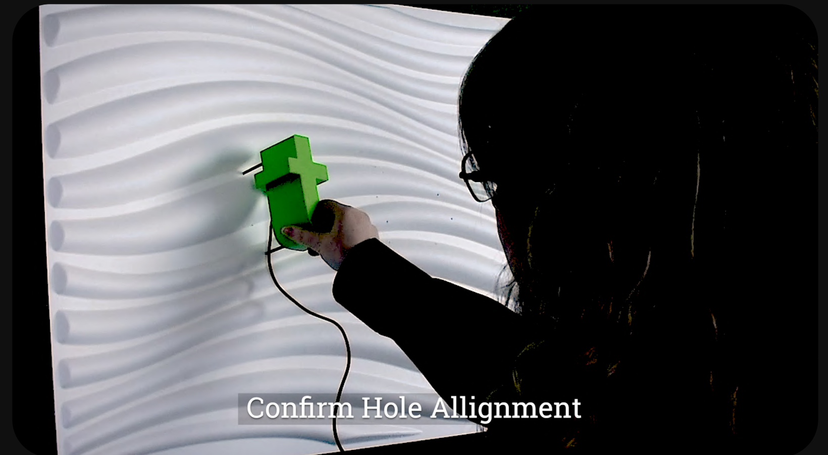
Confirm Hole Alignment