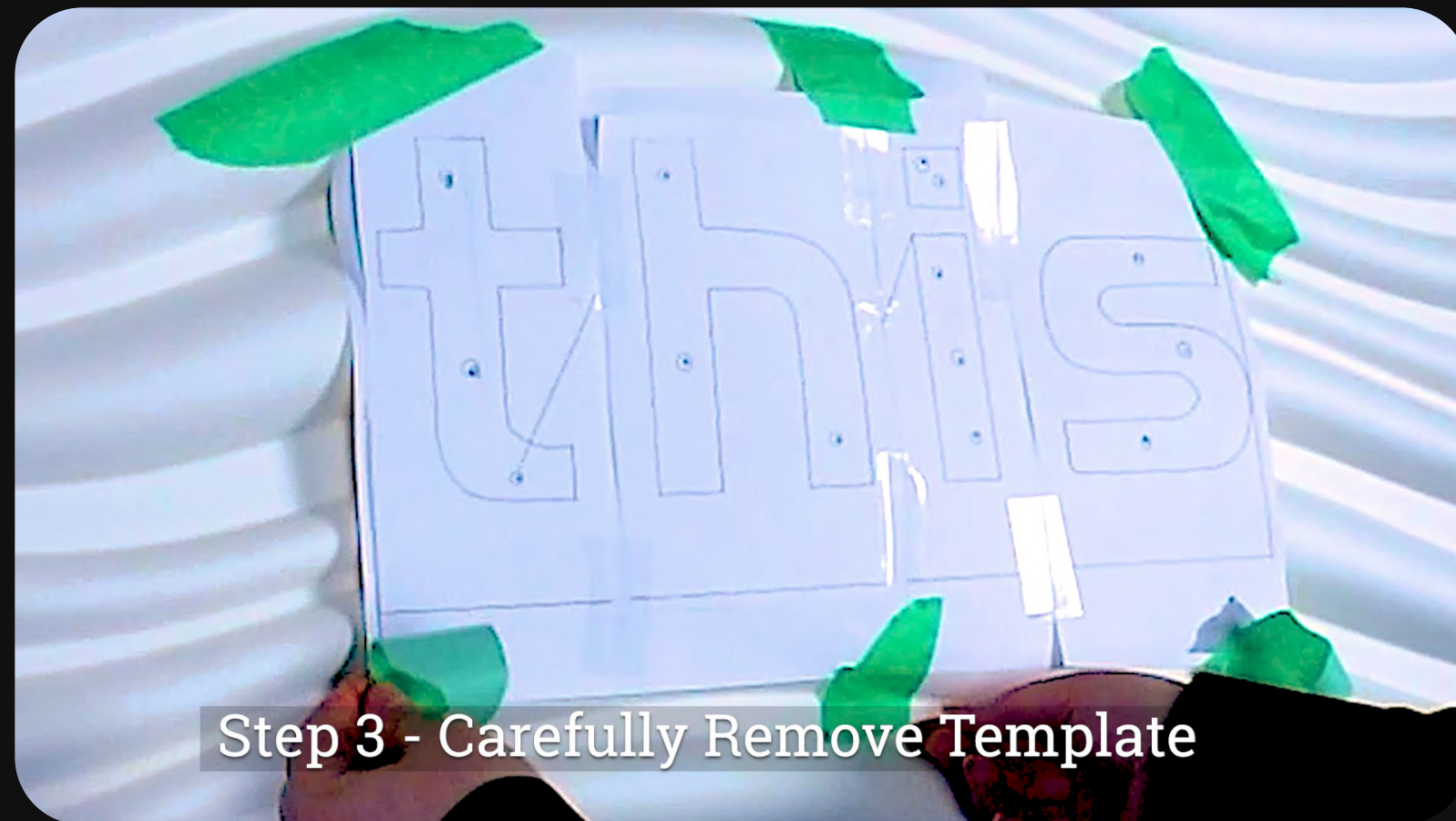
Step 3 - Carefully Remove Template